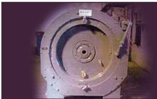
Electro Dynamic Break