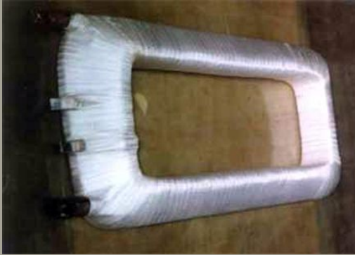
Edge Wound Coil Dully Potted