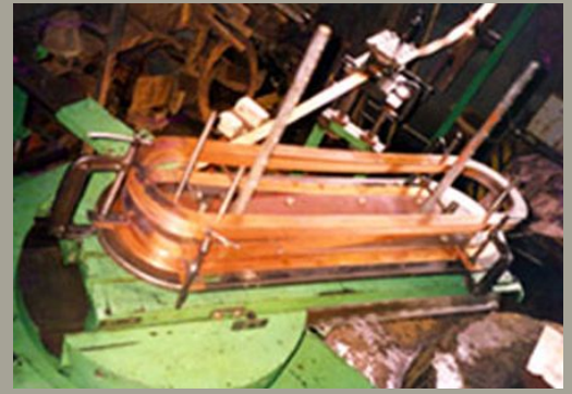
Coil Under Edge Winding