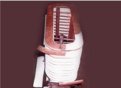
Coil After Edge Winding