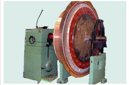
Commutator under Balancing