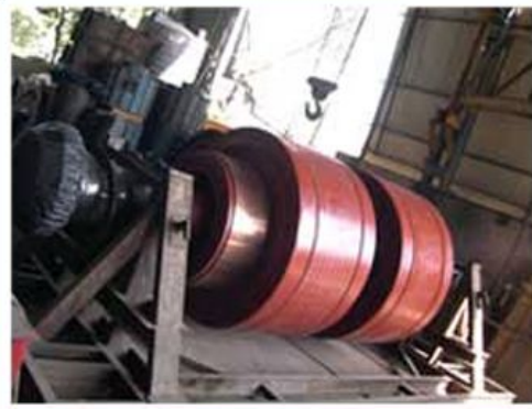
2 x 2400 kw TWIN DC Armature after rewinding