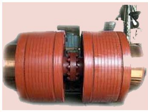
2 x 2400 kw TWIN DC Armature after rewinding